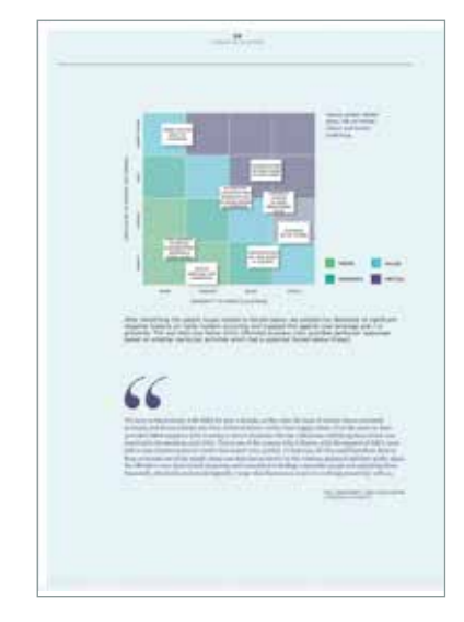
Fig. 3 ^{11}

Should a risk assessment identify high risk, but no specific instances, consider commissioning an in-depth investigation into the causes of that risk and identify mitigation strategies.